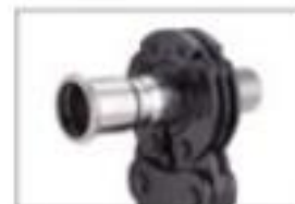
Thin-wall stainless steel pipe, Copper pipe.