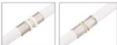
Multi-layer Composite Pipe.