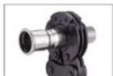
Thin-wall stainless steel pipe, Copper pipe.