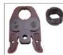
Universal Jaw Interchangeable die