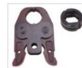
Universal Jaw Interchangeable die