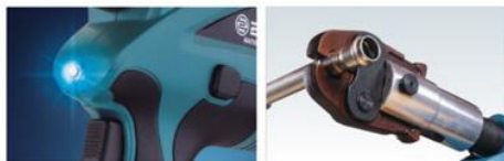
LED light for dark place.